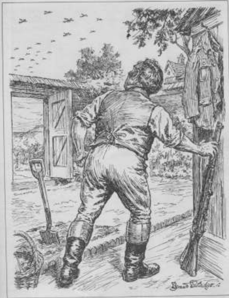
"AM I AN ISLAND?"

[In two days there were a quarter of a million applications for service in the Local Defence Volunteers.]